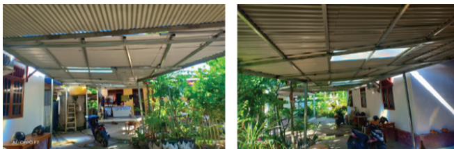
New awning between dining room and bedrooms