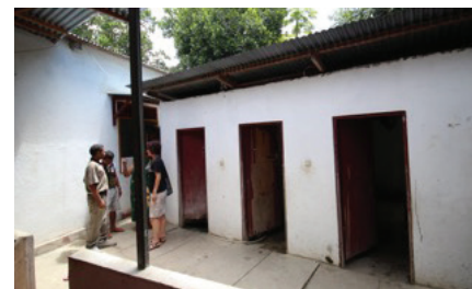
Above: Mal's photo of current bathrooms

Your gift can be received in two forms – either as a one-off donation or as a monthly direct debit. Please complete the donation form and post to PO Box 405, The Gap Qld 4061 or direct debit to Timor Children's Foundation BSB: 014-002 Account: 1101 81834 and send an email to Ruth on accounts@timorchildren.com to with your donation details. (This appeal is not tax-deductible).